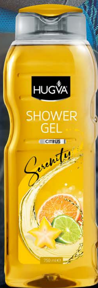
Hugva Shower Gel Serenity 750 ml MM11.2121