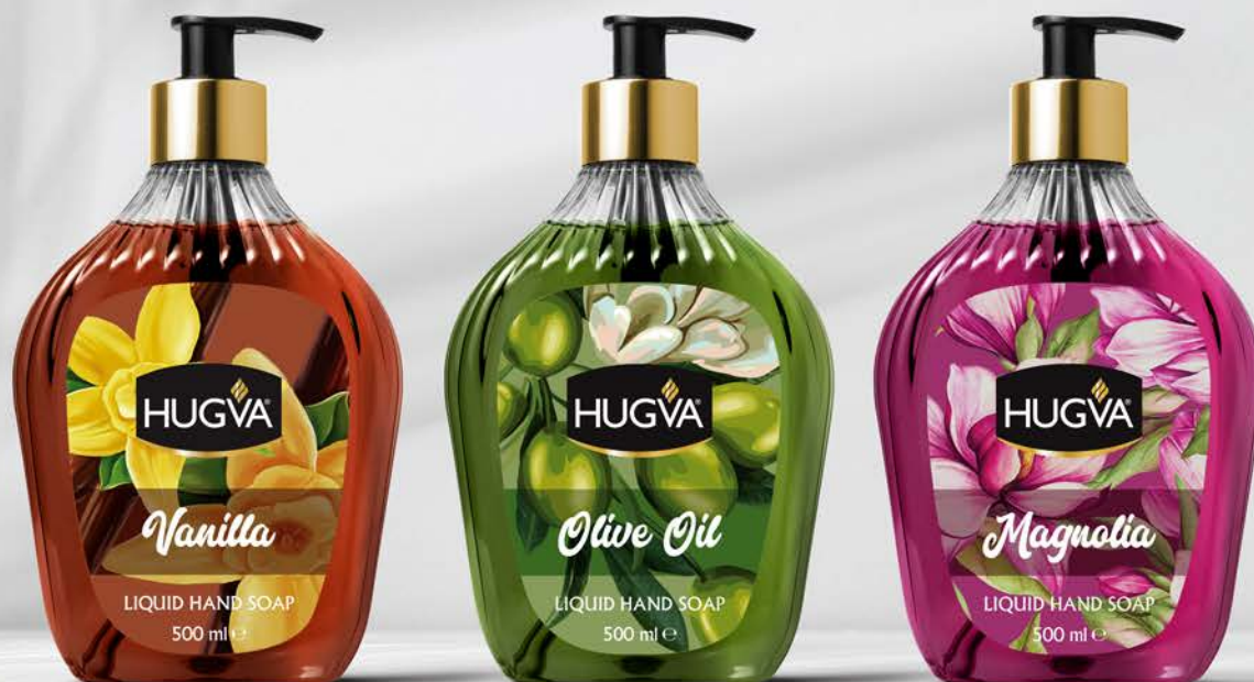
Hugva Hand Soap Vanilla 500 ml MM11.2200

Enriched with natural extracts, the special formula of Hugva Liquid Hand Soap gently cleanses your skin without harming it and keeps your hands moisturized and soft thanks to its moisturizing effect.