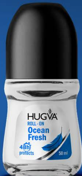
Hugva Roll-On Ocean Fresh 50 ml MM11.2311