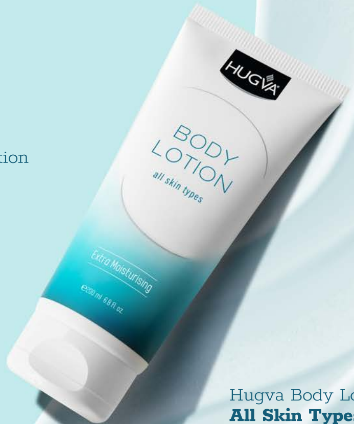
Hugva Body Lotion All Skin Types 200 ml MM11.2330

Hugva Body Lotion instantly replenishes, hydrates, and protects dry skin for 24 hours. This rich, creamy moisturizer contains a blend of moisturizing ingredients to help relieve dry, sensitive skin, leaving it nourished, soft, and smooth.