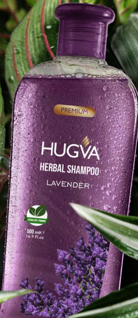
Hugva Herbal Shampoo Lavender 500 ml MM11.2060

is designed to nourish and support every strand, leaving you with touchably soft hair that provides a healthy feeling.