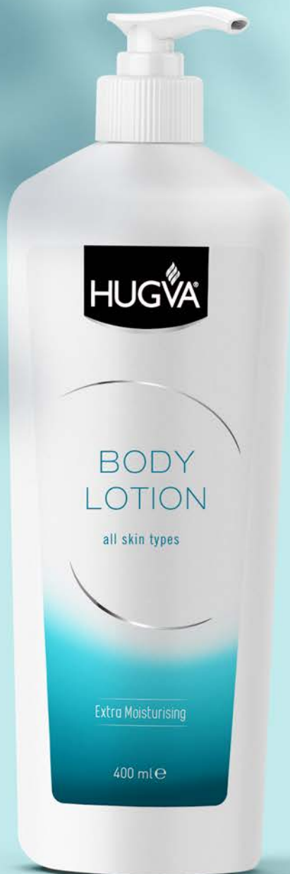
Hugva Body Lotion All Skin Types 400 ml MM11.2331