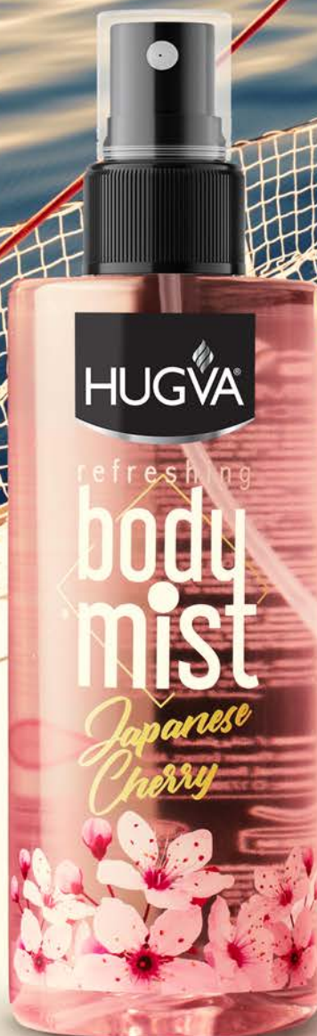
Hugva Body Mist Japanese Cherry 250 ml MM11.2301