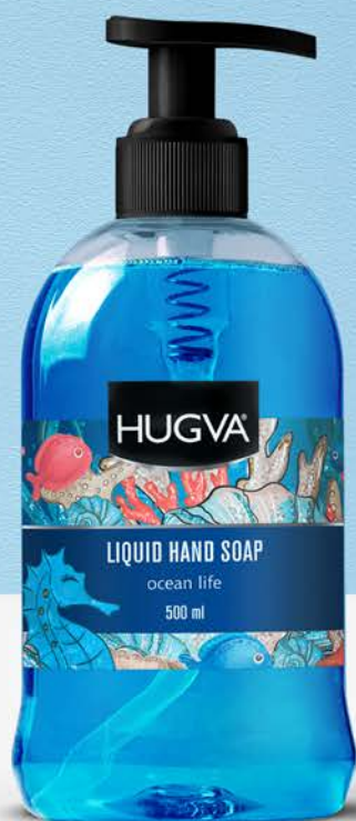
Hugva Liquid Hand Soap Ocean Life 500 ml MM11.2205

Hugva liquid hand soap removes dirt and germs while conditioning skin. Enriched with minerals and elements from sea and nature. Special skin therapy formula leaves skin feeling soft and smooth. Discover a new way to clean and nourish your skin.