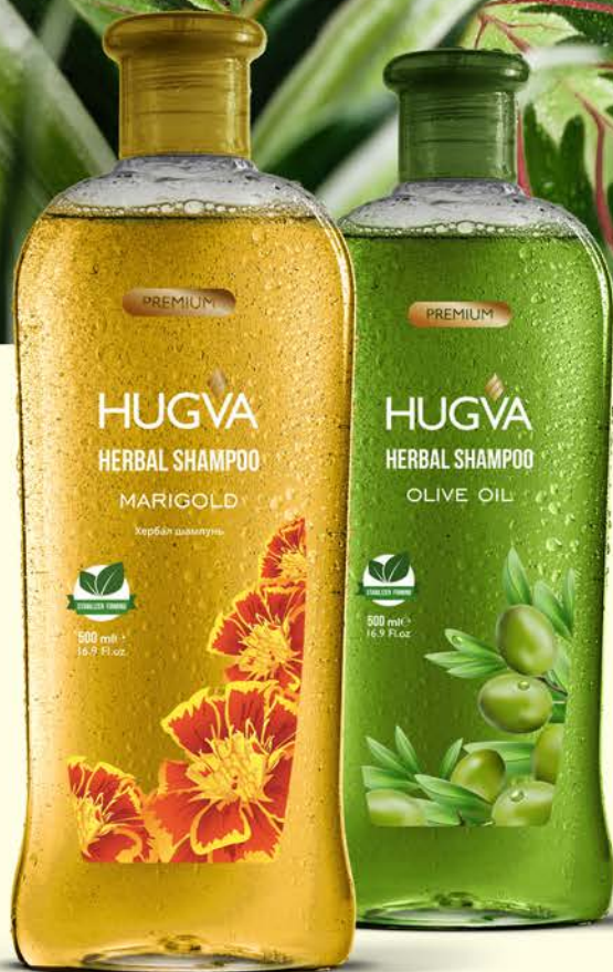
Hugva Herbal Shampoo Olive Oil 500 ml MM11.2061

Hugva Herbal Shampoo with Botanical Extracts helps support strong, healthy, growing hair. Its rich, luxurious formula gently cleanses, conditions and detangles hair while it thickens and returns hair to its natural healthy condition. Restores moisture to dry, brittle and damaged hair. Safe to use on all types of hair including color treated, bleached and relaxed.