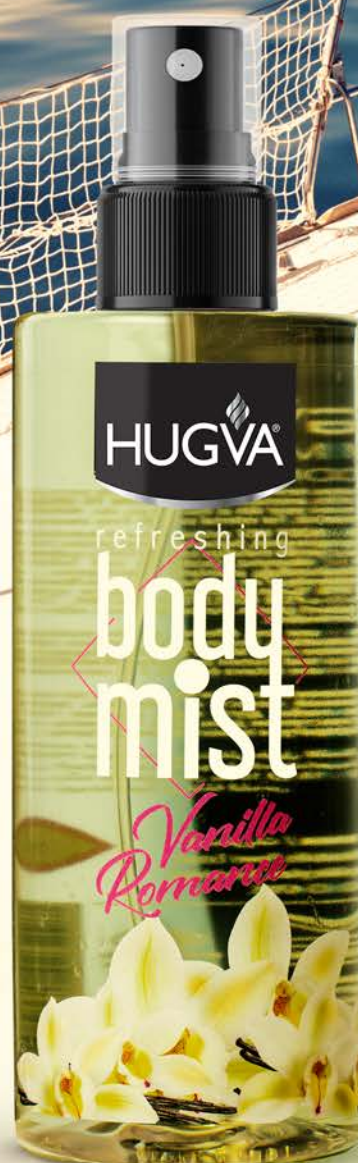
Hugva Body Mist Vanilla Romance 250 ml MM11.2302