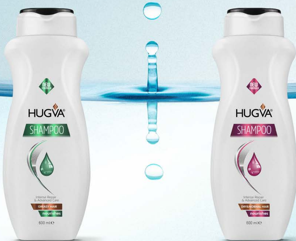
Hugva Shampoo Greasy Hair 600 ml MM11.2012