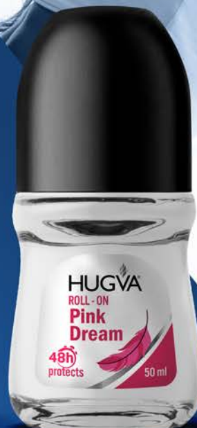
Hugva Roll-On Pink Dream 50 ml MM11.2310