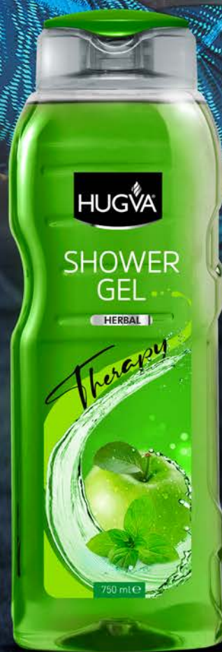
Hugva Shower Gel Therapy 750 ml MM11.2122