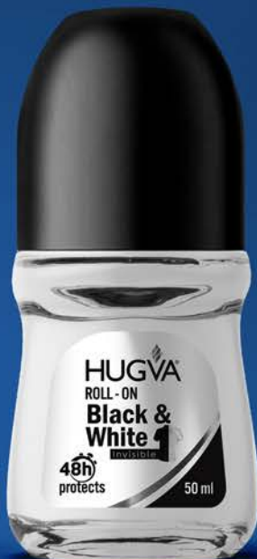
Hugva Roll-On Black & White 50 ml MM11.2312