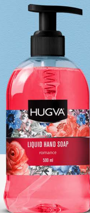
Hugva Liquid Hand Soap Romance 500 ml MM11.2204