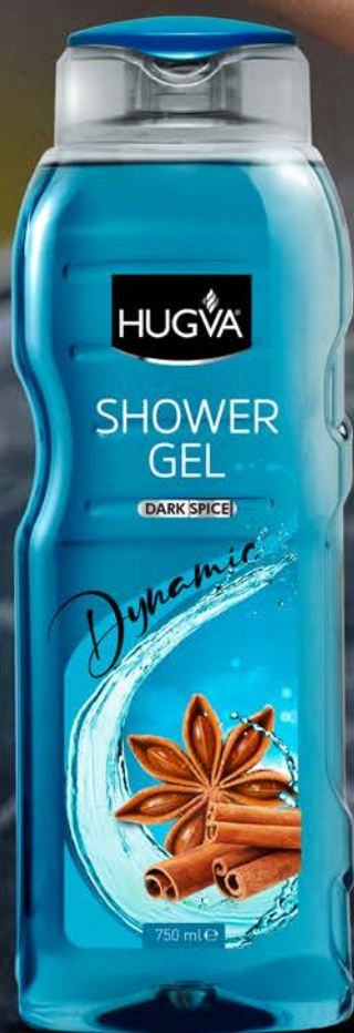
Hugva Shower Gel Dynamic 750 ml MM11.2120

For the ultimate shower experience after sports