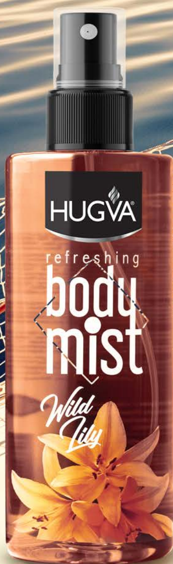
Hugva Body Mist Wild Lily 250 ml MM11.2300

Using an artisanal craft to extract essential oils from plants, we've captured the therapeutic power of pure nature. It inspires tranquility and promotes a peaceful spirit.